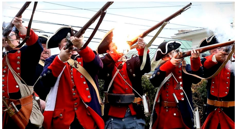
Photos above from Captain George Mercer's Company Exercises at Fort Loudoun site.